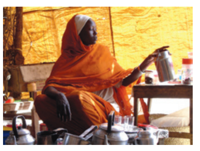
In conflict areas, displaced people such as this woman, who runs a coffee stand, take comfort in maintaining the routines of normal life.

your help to continue pursuing the following objectives with the communities we serve: