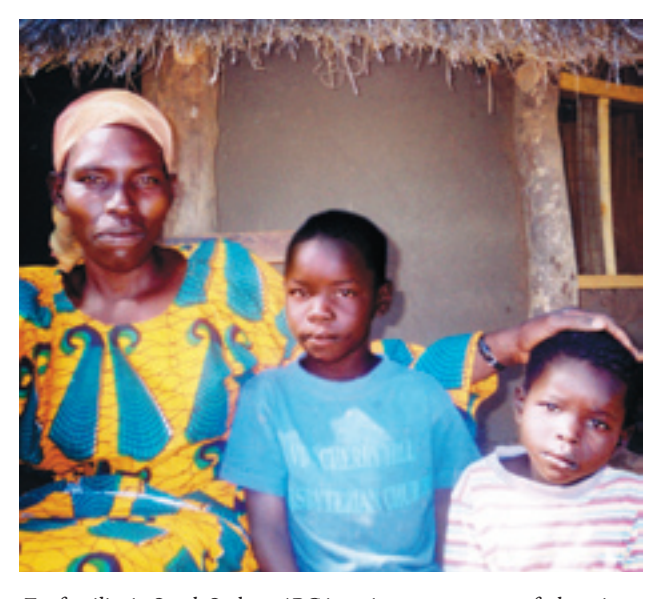
For families in South Sudan, ARC is an important source of education.

In 2006, 44 ARC health centers provided medicine and health education to communities in Magwi, Yei and Kajo Keji counties – increasing the quality and accessibility of health services for tens of thousands. Services include: immunizations, antenatal services for mothers and