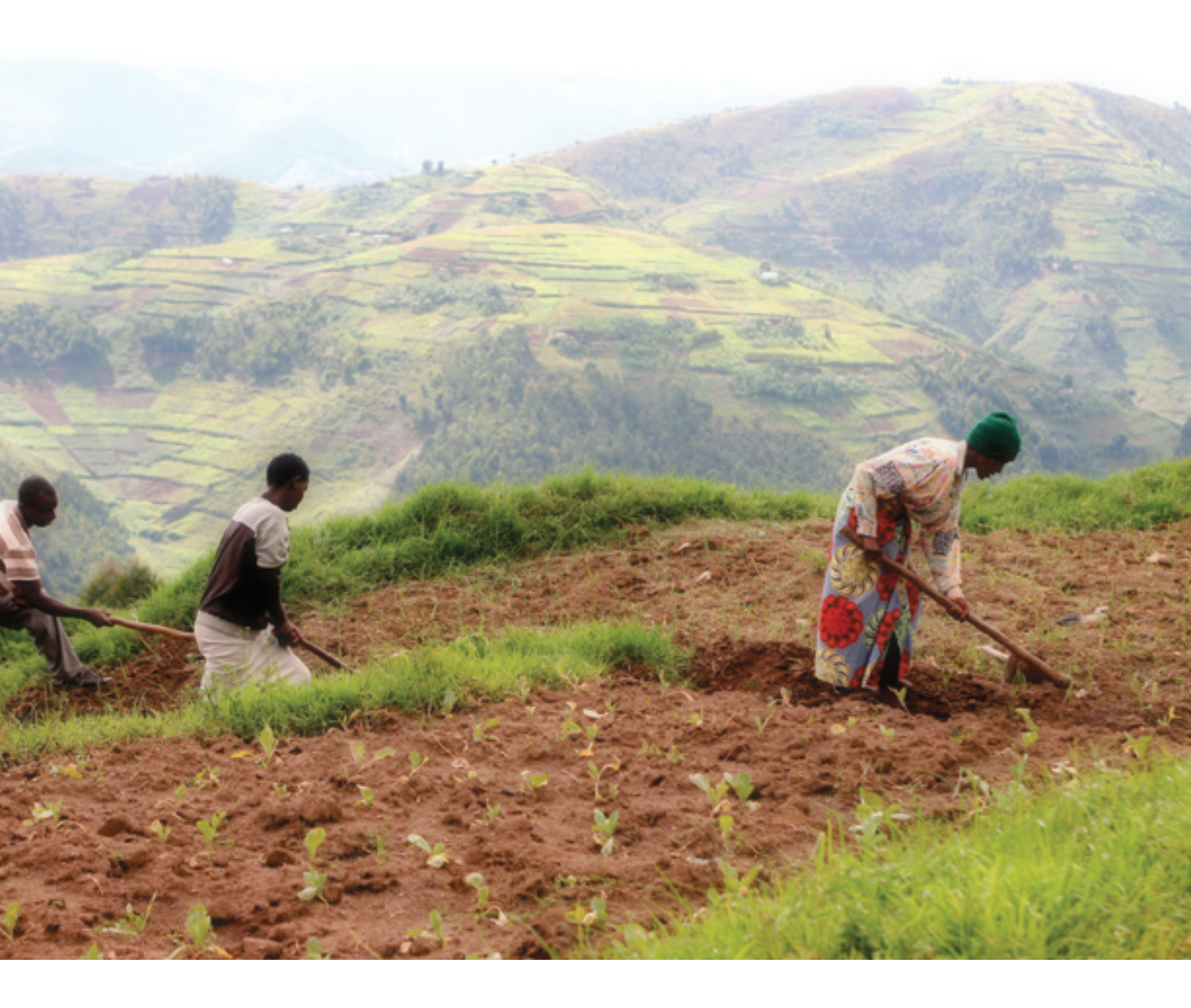
American Refugee Committee ARC 2006 Annual Report