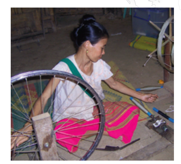
Resourcefulness is an essential characteristic for refugees. This woman is using an old bicycle wheel as a loom.

Last year, we educated more than 30,000 refugee camp residents on nutrition, disease prevention, sanitation, hygiene and HIV/AIDS. We provided drinking water and toilets to about 40,000 people in the camps, and we provided clinical services such as vaccinations against childhood diseases, care for pregnant women and assistance in child delivery.