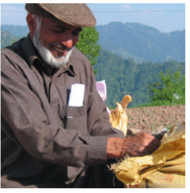
ARC distributes high-yield seeds, fertilizer and tools to help farmers who have lost everything get back on their feet.

In the south, we continued our work with Afghan refugees living in the Balochistan province of Pakistan. ARC operates seven health centers in Balochistan, caring for more than 170,000 refugees last year. Our emergency childbirth facilities are open 24 hours a day, seven days a week.