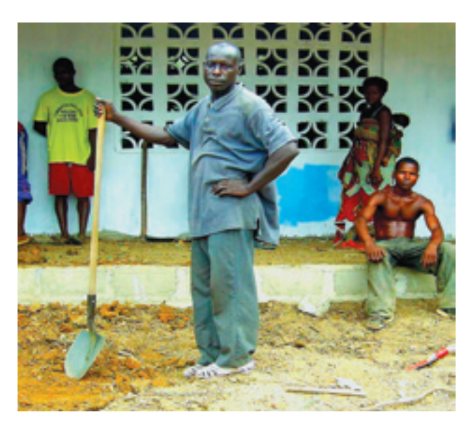
At the persistent requests of their children, the residents of Balama, Liberia, made building this school their top priority upon returning to the town after Liberia's civil war.

As Liberia has moved from an emergency to a transitional phase, ARC has continued to develop its four major program areas in the country: gender-based violence