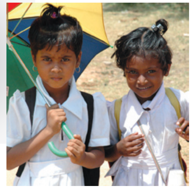
ARC's vaccination campaigns, nutrition programs and opportunities for fun and games improve the lives of hundreds of thousands of children each year.

ARC collaborated with the Sri Lanka Department of Agriculture to give hundreds of farmers future food