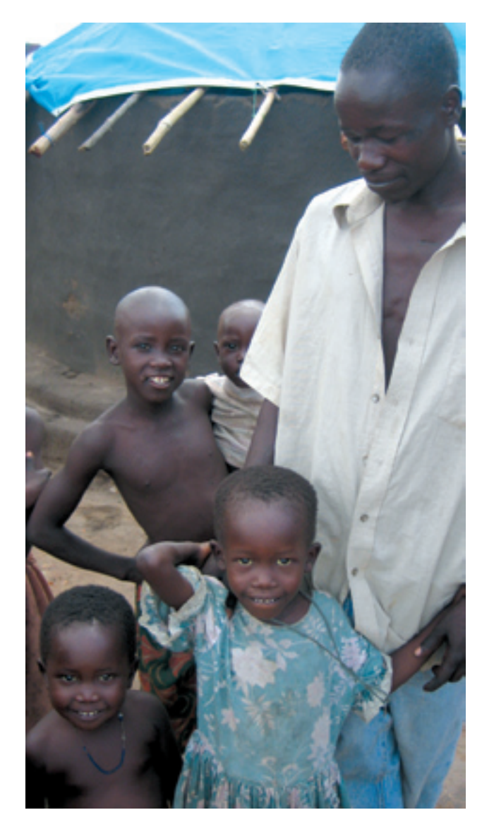
ARC is helping build hope and opportunity for this family in Pawel, Uganda.