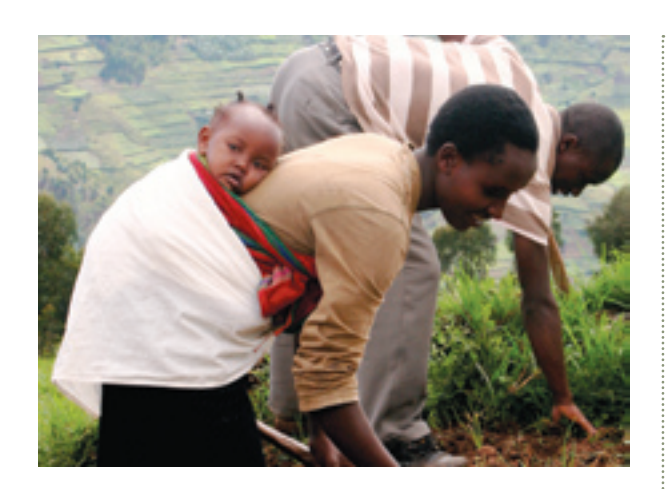
In 2006, ARC helped nearly 3 million people in ten countries take back control of their lives.